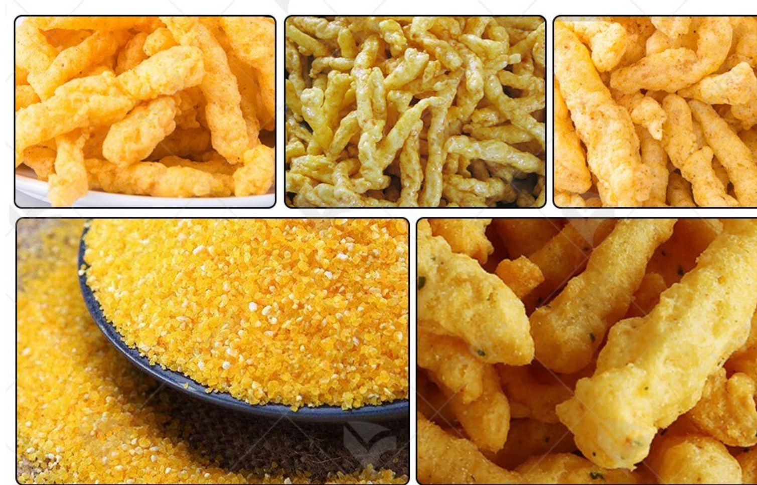
Competitive Advantages for Manufacturers

Investing in a fully automatic Kurkure factory provides manufacturers with a competitive edge in the highly dynamic snack industry. From cost efficiency to sustainability, the advantages of these state-of-the-art systems align with the goals of modern food provides.