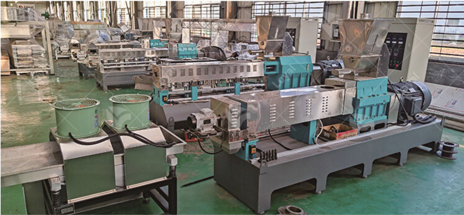
The Advantage Of Soya Meat Protein Process Line